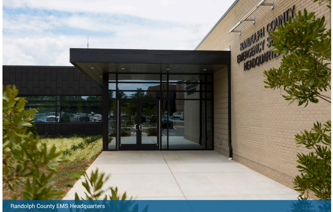
Randolph County EMS Headquarters

This new 2-story, 35,432 SF brick veneer building houses Randolph County's emergency services offices, and features a kitchen, bunk rooms, fitness center, locker rooms, EMS telephone and datacom rooms, and their emergency operations center.