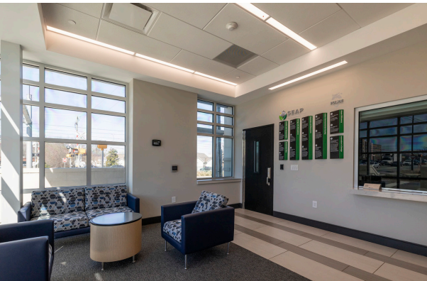
University City Division Station

16,000 SF, new two-story police station and separate parking lots for both visitors and staff. Work consists of Type VB Fully Sprinkled Construction utilizing reinforced concrete walls insulating concrete forms, structural steel, CMU, steel joists and metal deck roof framing. The project also includes a pre-engineered parking canopy, masonry site walls, retaining walls, underground detention system, dumpster enclosure, geothermal system, and photovoltaic panels.