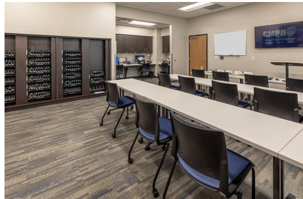
University City Division Station