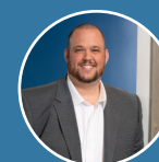
Grey London Project Manager