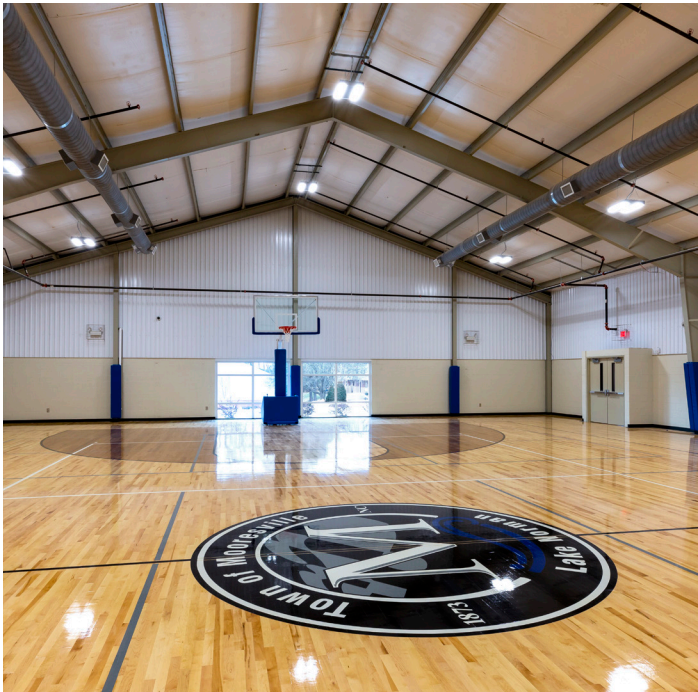
Selma Burke Community Center

Construction included site work (landscape, furnishings, and signage), renovations to the existing gymnasium, and a new 8,000 SF pre-fabricated multi-purpose building. The 8,000 SF expansion features a renovated gym with new basketball courts, a new playground and picnic shelter, and a multi-purpose building with classrooms.