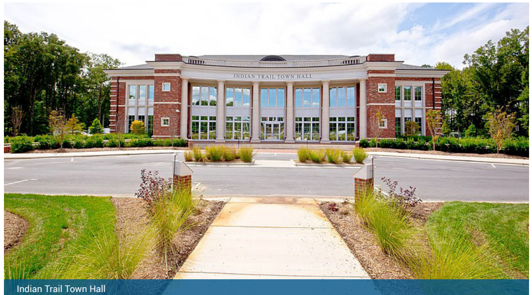
Indian Trail Town Hall