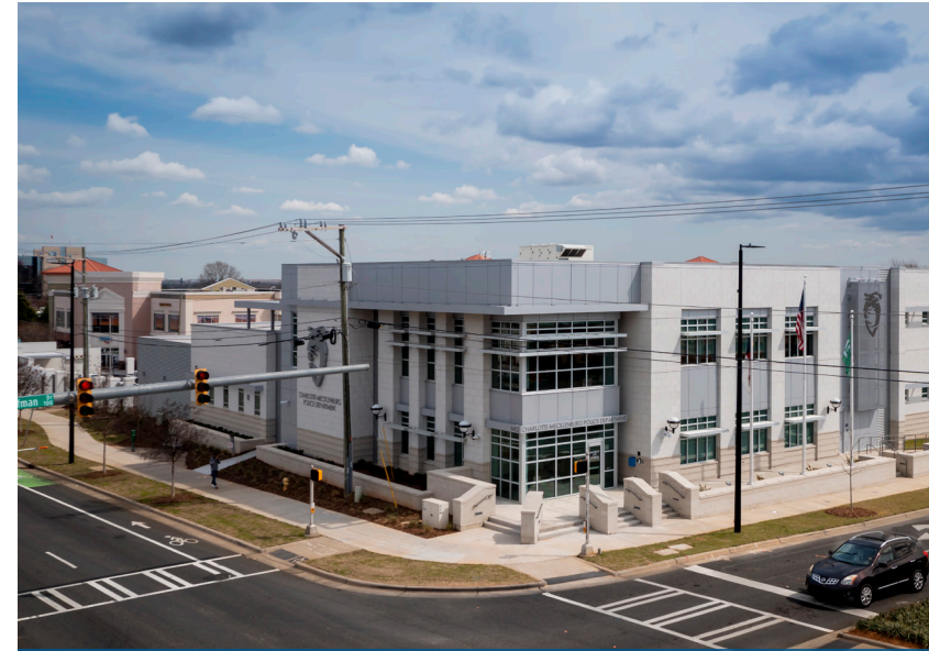
University City Division Station

Our IMMPact Team delivers excellence and satisfaction to every client, every project, every time. We are a cohesive unit in constant communication about your project.