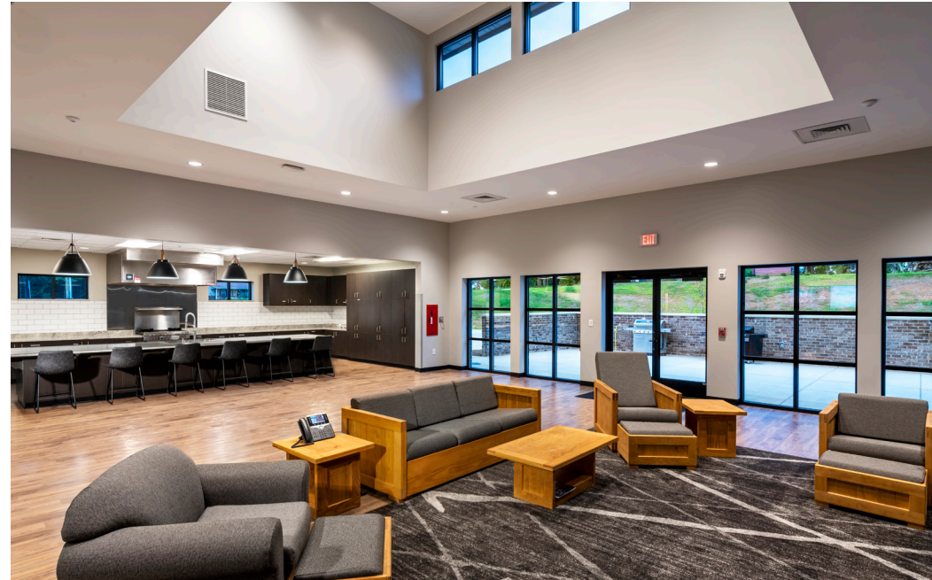
Fire Station No. 6